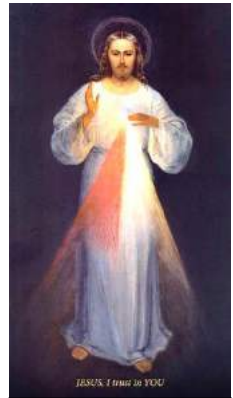
The original Divine Mercy image

In her diary she wrote that Jesus told her: « Paint an image according to the pattern you see, with the signature: "Jesus, I trust in You" [ in Polish: "Jezu, ufam Tobie" ]. I desire that this image be venerated, first in your chapel, and then throughout the world. I promise that the soul that will venerate this image will not perish.». - Jesus also told her that he wanted the Divine Mercy image to be «solemnly blessed on the first Sunday after Easter; that Sunday is to be the Feast of Mercy.». - Not knowing how to paint, Faustina approached some other nuns at the convent for help, but received no assistance. Only three years later, after her assignment to Vilnius, the first artistic rendering of the image was performed under her direction. The painting now hangs in Vilnius, Lithuania. Symbolic meaning: The coloured rays streaming out from the heart of Jesus have symbolic meaning... red for the Blood of Jesus, which is the life of souls, and white for the Baptismal water which justifies souls. The brightest point in the picture is the heart. The light on the forehead signifies the presence of the Father. - The whole image is symbolic of the mercy, forgiveness and love of God.